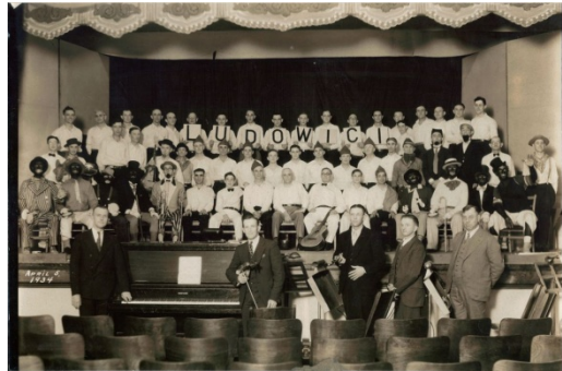
1934 Minstrel Show sponsored by Ludowici-Celadon at Opera House

Unfortunately, the Opera House and balcony was gutted in 1965 to make room for modern fire engines and office space above.